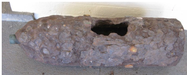
Figure 40 - Corroded Mk I Studded Common Shell.

On Wednesday the 15th of August 1877 Captain Mandeville had a small topgallant sail taken ashore, and erected in front of the sandstone cliff between the quarantine ground and Point Nepean. Cerberus then anchored 3,800 yards (3.5 kms) off shore and fired ten studded rounds from each turret at the target.