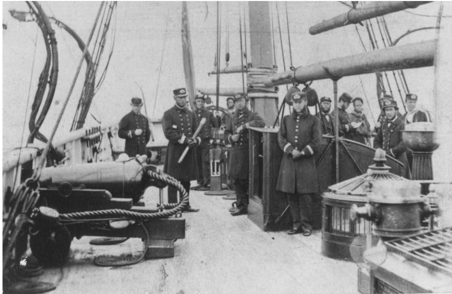
Figure 7 - Main Deck of HMCS Victoria with a 25 cwt 32 pounder Gun c 1861-63

Although Victoria and her crew left for New Zealand before the Armed Vessels bill had passed, the men were still signed on under its provisions and the bill was read out to the men hired under it. 48